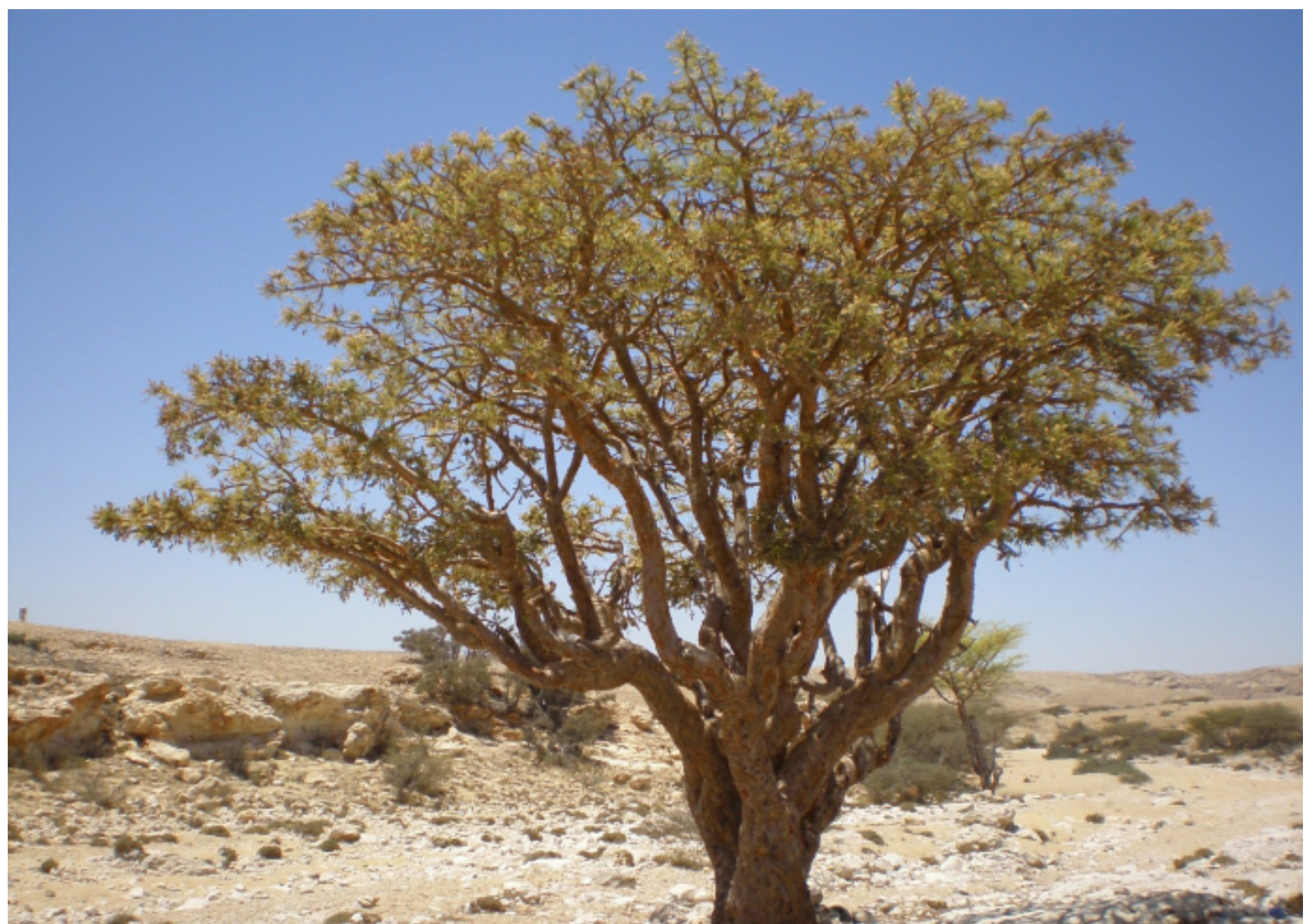
Frankincense tree (genus Boswellia), taken in Oman.

According to the authors of the study, these findings can now be used on the one hand to test the boswellic acids from frankincense in relevant disease models and perhaps also as a drug to treat inflammatory diseases. On the other hand, thanks to the newly discovered binding site on 5-lipoxygenase, other potential drugs can be developed and other anti-inflammatory agents tested in experiments.